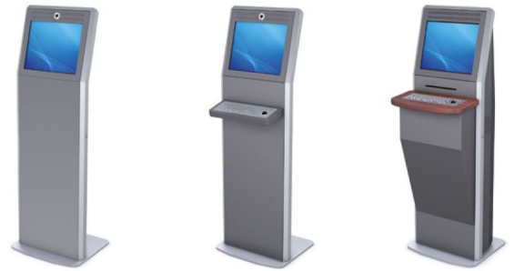
ASTALON basic version, with keyboard and with laser printer