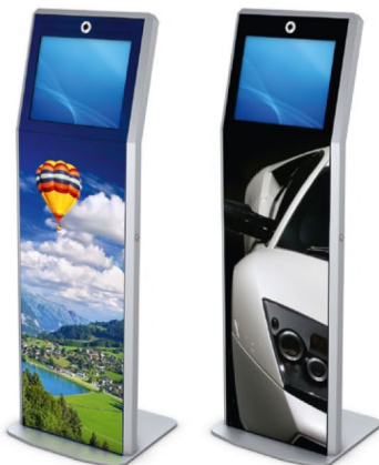
Individual design through the use of stick-on graphics

Some examples of possible uses of the ASTALON model include providing general information, for wayfinding, as a POI or POS, for time recording, for providing employee information, as a virtual porter, or for trade shows and multimedia presentations.