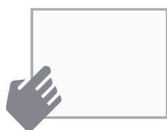
REMOVABLE / REUSABLE